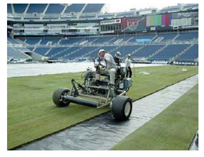
West Coast Turf installed a temporary natural grass field over the existing FieldTurf surface at Qwest Field, in preparation for the March 29, 2003, U.S.—Venezuela exhibition soccer match.

The inaugural use of this unique application came in March 2003 when West Coast Turf harvested more than 87,000 square feet of Tifway II bermuda sod from its California sod farm. The sod, which had been overseeded with perennial rye grass, was then shipped and installed for an exhibition soccer match at Seahawks Stadium between the United States and Venezuela. Later that season West Coast Turf converted the field to natural turf again for a match