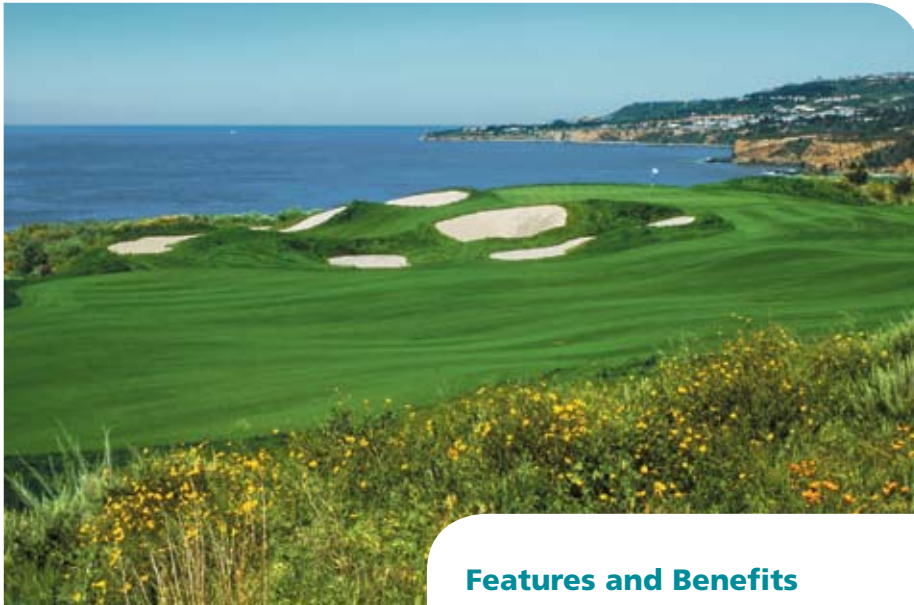
Tifway II carpets the fairways at Ocean Trails Golf Club, designed by Pete Dye, in Rancho Palos Verdes, CA.