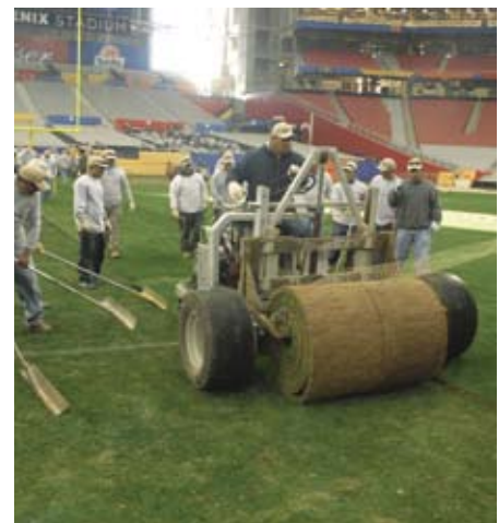
Crews install new sod for the BCS Championship game directly over the Fiesta Bowl field.