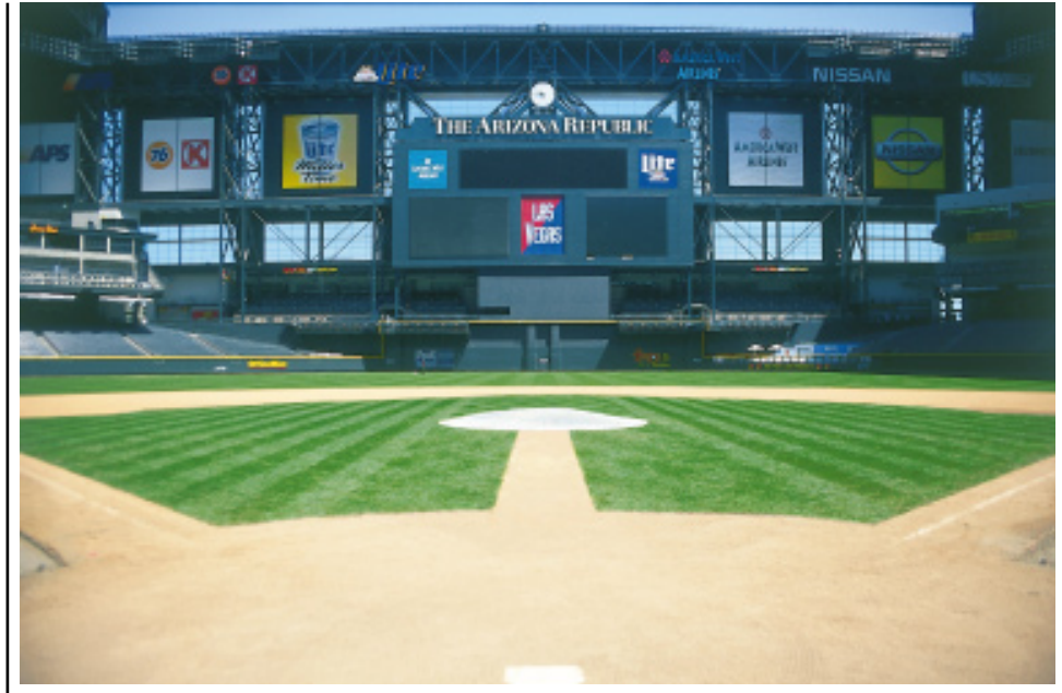
Bull's-Eye takes the field with toughness, improved shade tolerance and quick spring green-up.

West Coast Turf Life is short. Sod it! ©2001 West Coast Turf 9/01