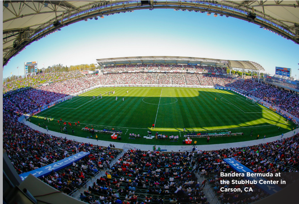
Bandera Bermuda at the StubHub Center in Carson, CA

Bandera Bermuda is West Coast Turf's newest and most versatile drought tolerant bermuda ever produced.